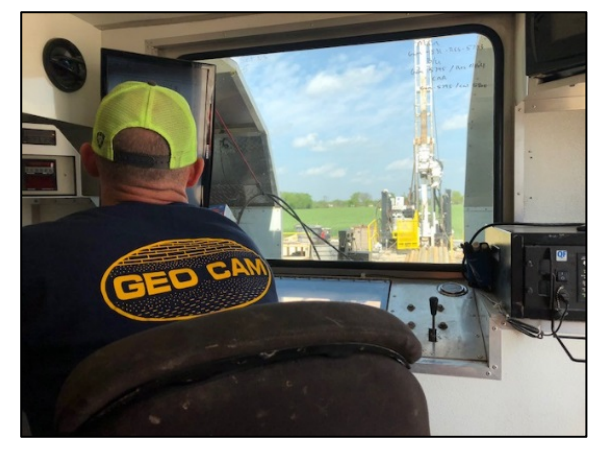
Initial Logging of Core Hole

<u>Task 5: Monitor Well Design</u>. INTERA completed the specifications, and those technical requirements were incorporated into the NBU RFB documents for the monitor well construction. Work during this period involved answering questions from the selected contractors and reviewing data from the coring activities._