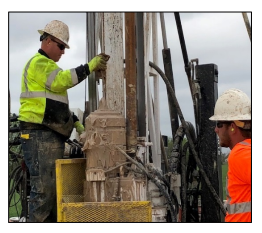
Closeup of Coring Operation