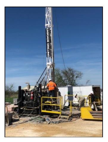
Cascade Drilling Rig

Photographs of the coring and logging operations are shown below.