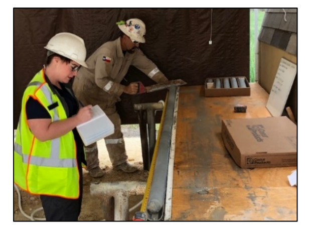
EAA Geologist Observing Core Analysis