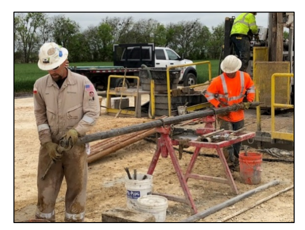
2.5-Inch Core Being Removed from Tool