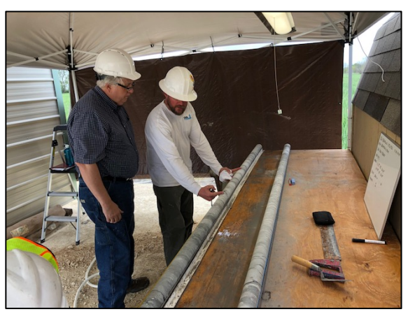
Geologists Measuring and Analyzing 10-Ft Core